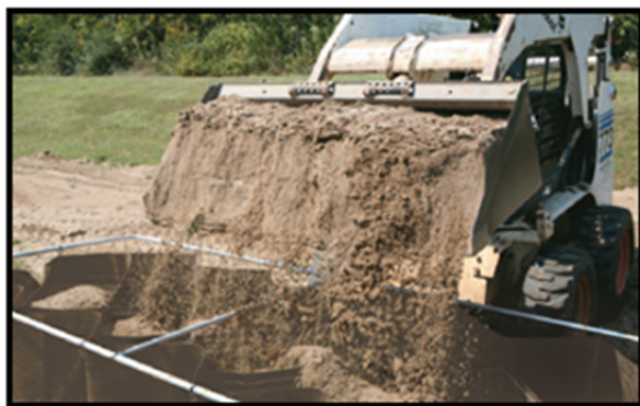
Geocells can be filled manually or with standard construction equipment

Sandbags are expressed as full volumes only. Sandbags time is estimated at 12 seconds per sandbag and is based on using an automated sandbag filling machine in close proximity to the wall. Sandbag fill time estimation: as determined from http://bucketbagger.com/ Sandbag fill volume information: as retrieved from http://www.ag.ndsu.edu/pubs/ageng/safety/ae626w.htm . NSDU. (2010)