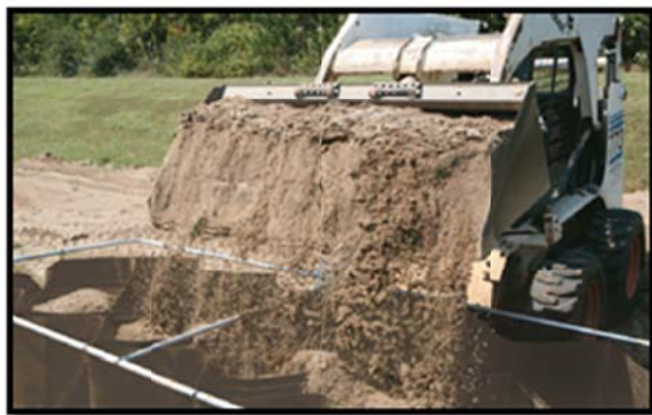
Geocells can be filled manually or with standard construction equipment

Sandbags are expressed as full volumes only. Sandbags time is estimated at 12 seconds per sandbag and is based on using an automated sandbag filling machine in close proximity to the wall. Sandbag fill time estimation: as determined from http://bucketbagger.com/ Sandbag fill volume information: as retrieved from http://www.ag.ndsu.edu/pubs/ageng/safety/ae626w.htm . NSDU. (2010)