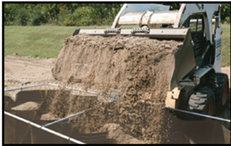
Geocells can be filled manually or with standard construction equipment

Sandbags time is estimated at 12 seconds per sandbag and is based on using an automated sandbag filling machine in close proximity to the wall.