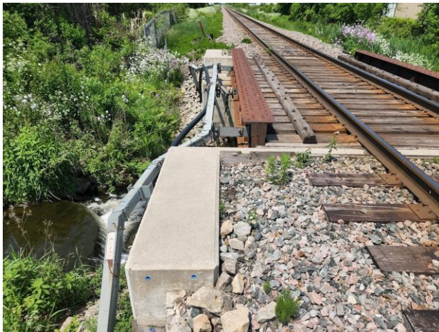
Vegetation along tracks