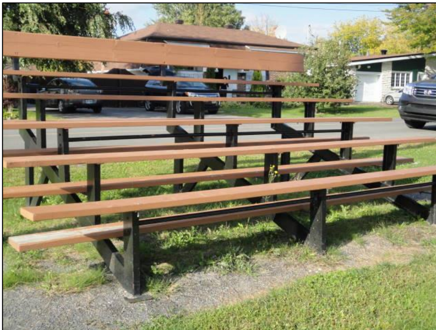
Stands before the Biobarrier installation.

The only solution was to install Biobarrier .